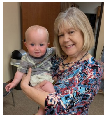
Guess who visited in July?!

For more information, go to www.edod.org (the main page scrolls to retreat and registration info)